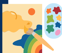
Illustration is another creative career that you may wish to consider. Here is free library of illustration resources to help you on your way to monetizing your skills.

Are you considering a career in publishing? The Society of Young Publishers are pleased to present Inside Publishing, the podcast series interviewing industry experts on everything publishing. You can listen here .