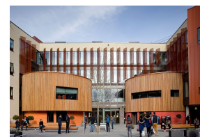
Anglia Ruskin University

"Our story starts in 1858, when the art critic, patron and philanthropist John Ruskin opened Cambridge School of Art. The art school grew to become Anglia Ruskin University, shortened to ARU, and it's still at the heart of our modern-day campus in Cambridge."